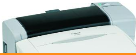
Imprinter 50F for Front-Side Imprinting