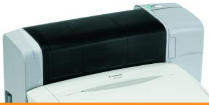
Imprinter 50B for Back-Side Imprinting